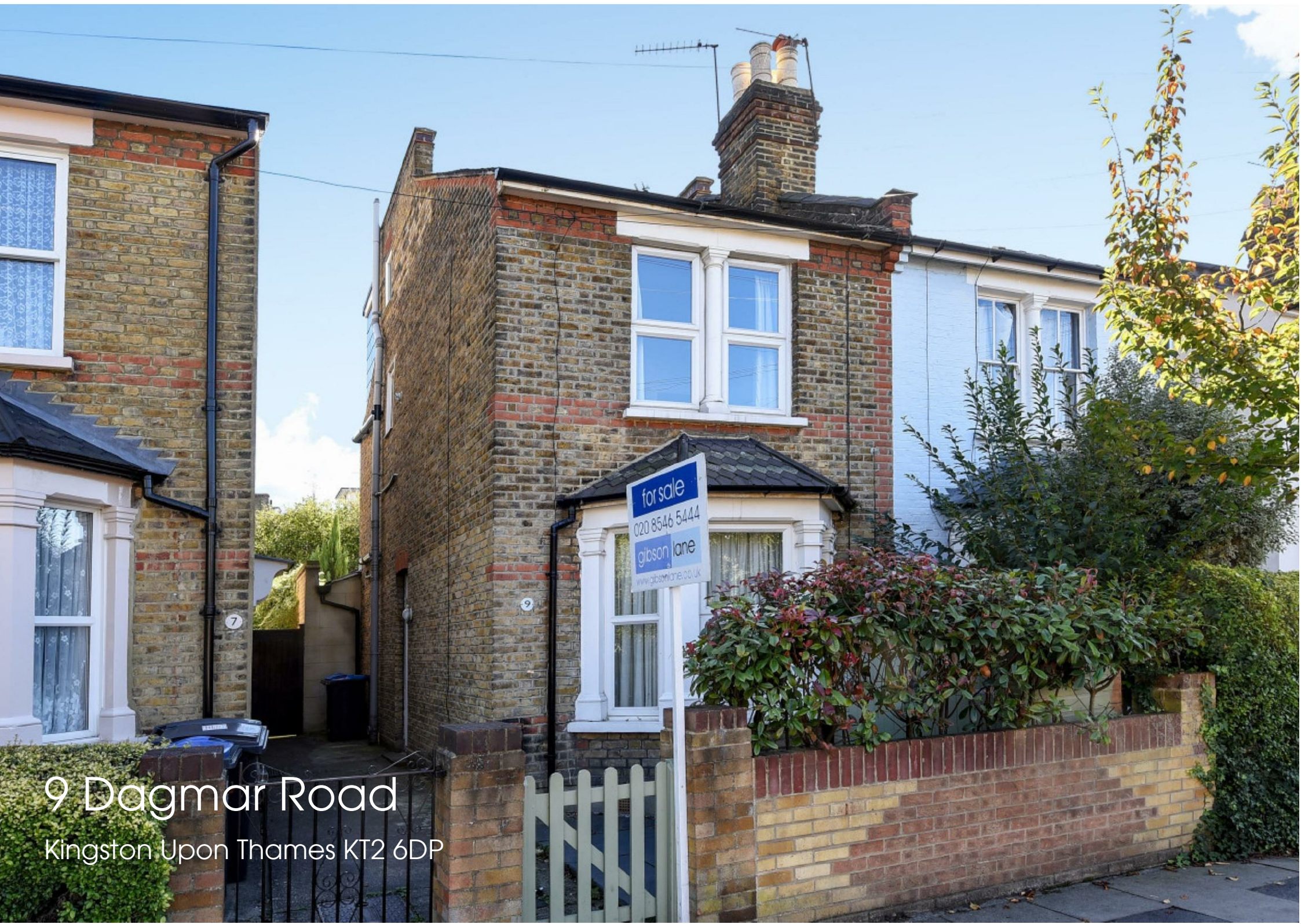
9 Dagmar Road Kingston Upon Thames KT2 6DP